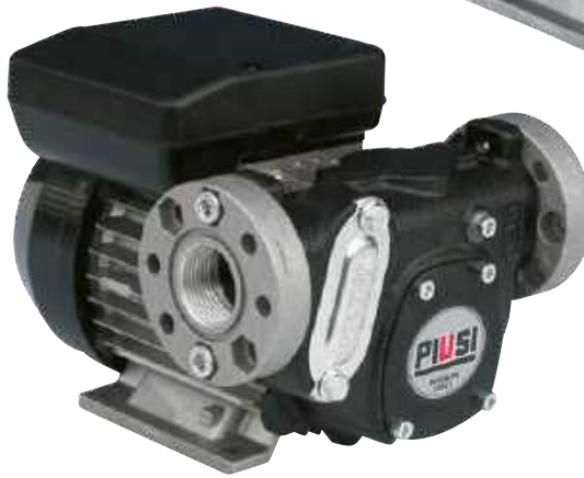
PANTHER 72 - PANTHER 90 (flanges included)