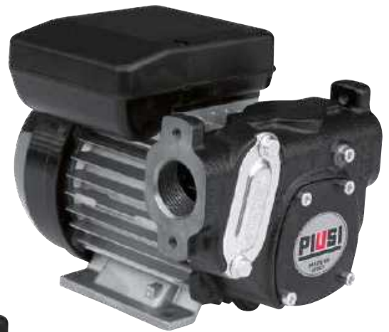
PANTHER 56 (flanges not included)